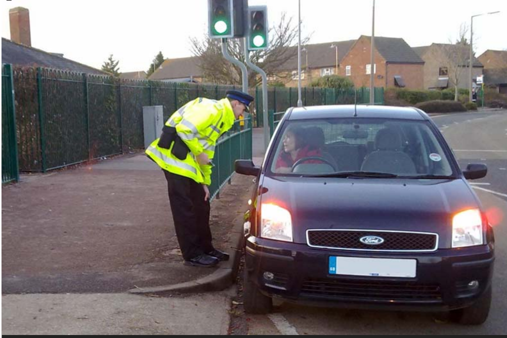
A PCSO talks to a motorist whilst on patrol outside a Shoebury school

In response to public concerns, police in Shoebury are actively tackling the problem of inconsiderate driving and parking outside schools.